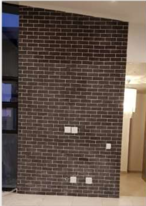
Black Satin Clay Brick Tile exposed clay brick tile wall. This wall was not cleaned properly with clean water and sponge after application and resulted in Tile Grout marks over the face of the Clay Brick Tile.