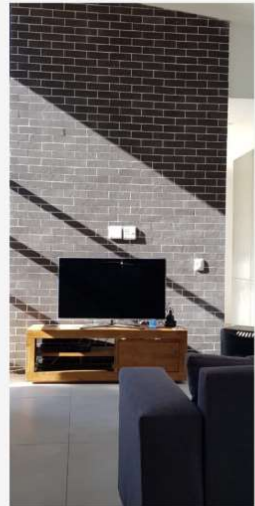
Exposed wall after cleaning with TFC Grout Off and Easy Clean